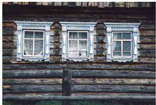
Decorations are local, materials and craftsmanship are common for the Baltic Sea States. Kargopol, Russian Federation.

The Working Group activities have created a basis for a continuous co-operation between institutions and experts around the Baltic Sea. Sustainability will