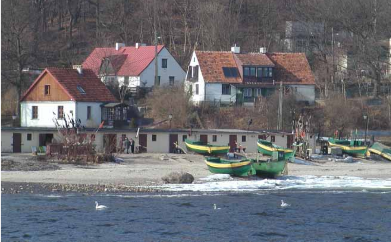
Old fishing boat station and adjacent buildings of the former village adapted to present needs. Orłowo the Gdynia district, Poland.

The seminar was during the planning phase though extended and developed into the 1 st Cultural Heritage Forum, including all the activities of the Monitoring Group and the Working groups on Cultural Heritage Co-operation. At this Forum more than 60 scholars and speakers from the Baltic Sea states presented themes on cultural heritage. The programme included the following: