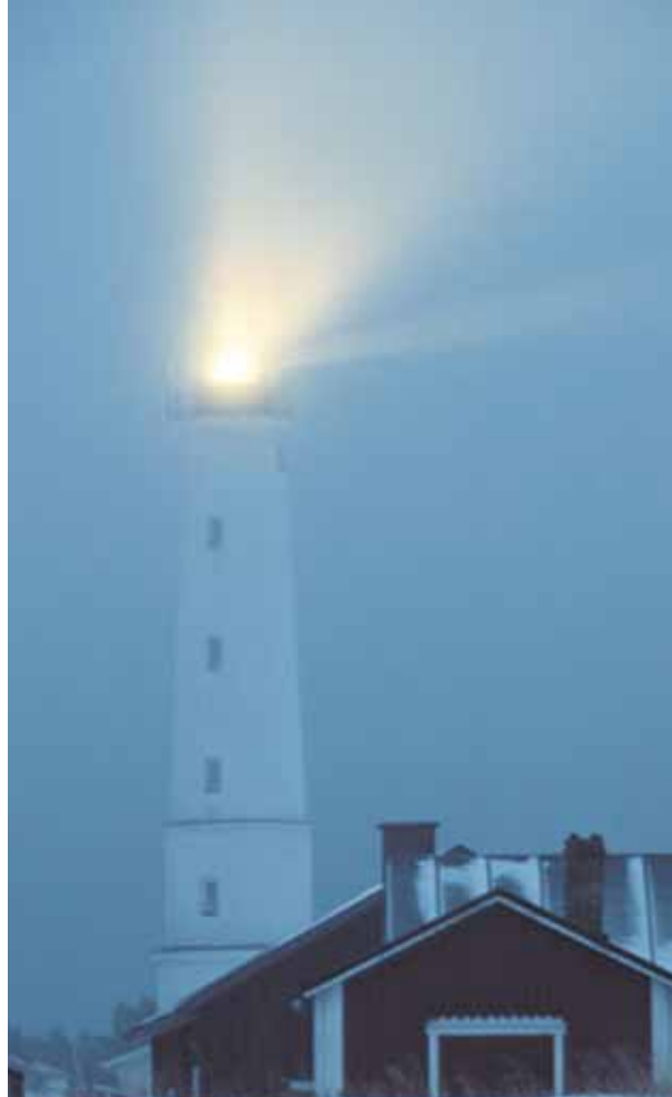
Lighthouse at Marjaniemi, Finland.

Lighthouses are some of the oldest aids to navigation and have marked the main highways along our coasts for centuries. Throughout their history they have benefited from the development of new technology and increasingly automated equipment. Ironically these same advantages have gradually eroded the need for manned lighthouses. Today the majority of lights world-wide are automatically operated and no longer require personnel. Many others have been decommissioned from service. Continual exposure to the harsh maritime environment and no regular maintenance means these buildings rapidly deteriorate. It is this threat which many Baltic Lights now face.