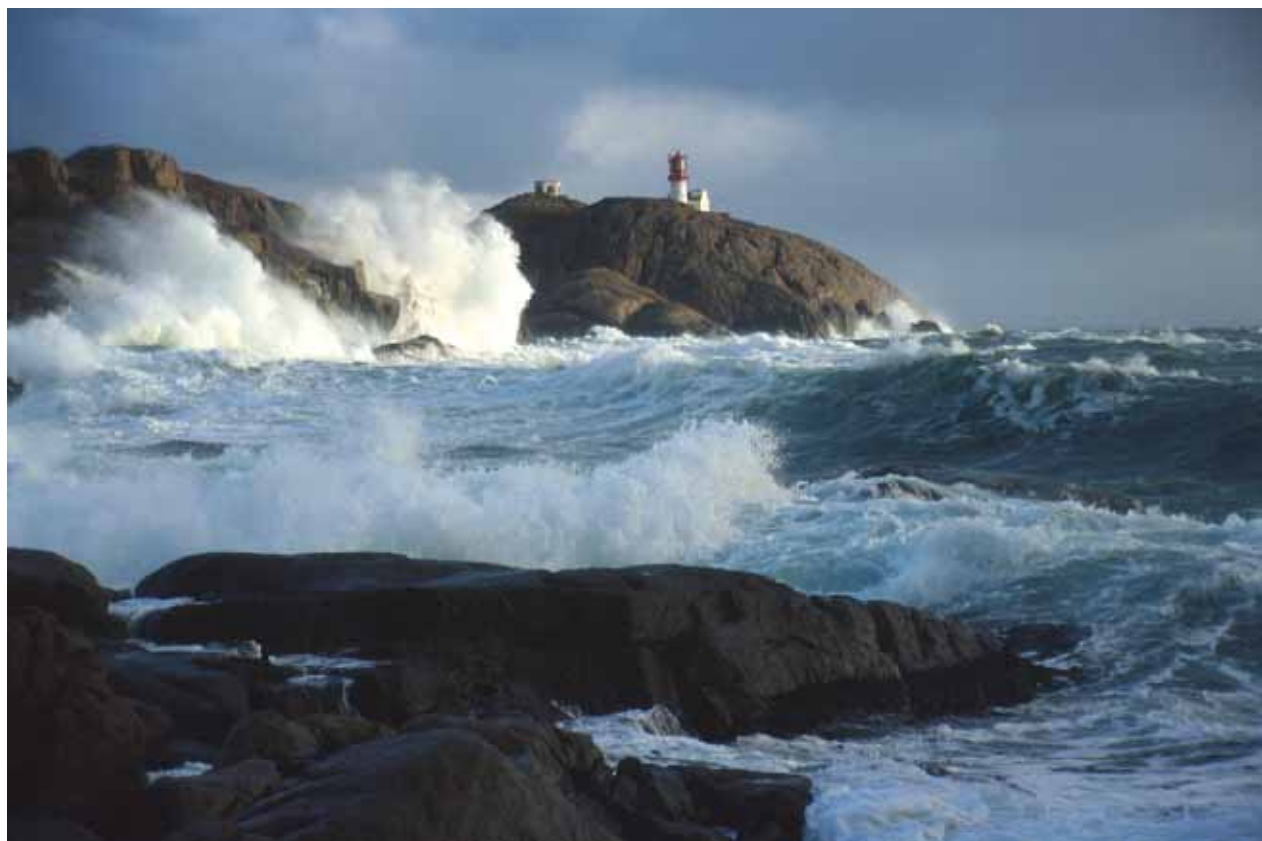
Lighthouse at Lindesnes, Norway.