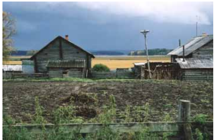
Below: Kenozero, Russian Federation.