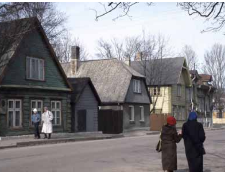
The local urban heritage forms an important part of the local identity. Its important to involve the inhabitants in the process of good management of the local heritage. Photo from the town Kallaste, Estonia.

The working package Professional Tools creates a platform for authorities, researchers and professionals to exchange and compare management experiences. It collects and analyses good methods for integrated conservation and urban sustainable development, including regional and local conservation policies in the Baltic Sea Region. Further it also aims at stimulating EIA (Environment Impact Analyses) and SEA-methods and resource thinking of management of urban heritage.