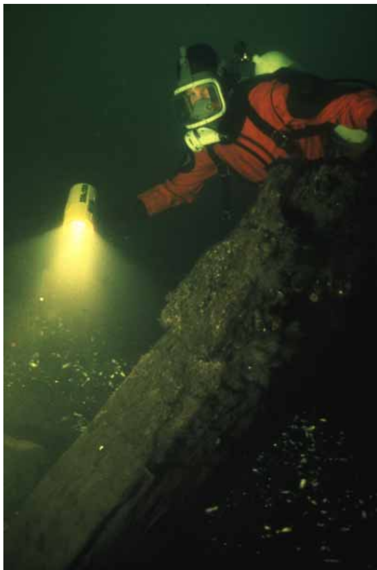
A Swedish wreck in Danish waters – a code of good practise, exchange of information leads to co-operation on protection for the benefit of mankind.