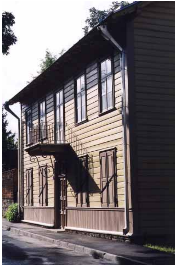
House owners and inhabitants of the wooden suburb of Kalamaja in Tallinn is the main target group for the "Information Centre for Sustainable Renovation" at Väike Patarei 3. The renovation of the building itself is recorded in the prize-winning film "Kalamaja – Possibilities of a Wooden Town".

Building preservation is depending on the supply of materials, which are not always easily available – sometimes because the demand is very small (i.e. bricks) or because they are regarded as environmental threats (i.e. wood tar). The problems are similar in all countries around the Baltic Sea. To get an overview of the situation the working group has gathered information on some of the key products and materials, with the aim to create institutional networks and to create a basis for common actions. The report also includes lists of literature, of research documentation, manuals and information sheets – thus establishing a basis for translations and exchange of experience.