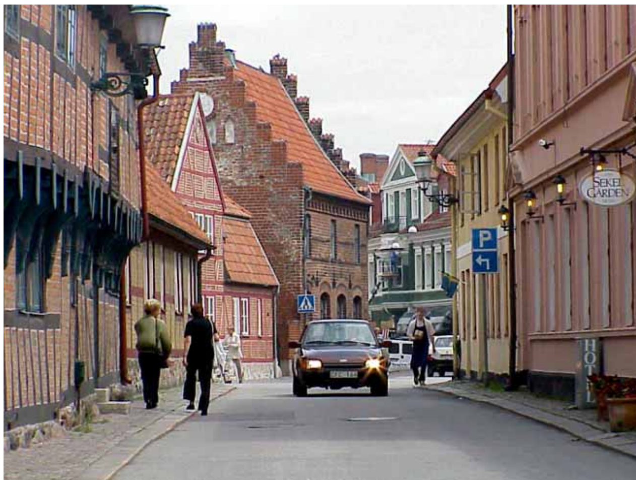
The streetnet in historic towns seldom meets the demands of modern traffic. The urban heritage is, however, best preserved when integrated in everyday urban life. Streetview from Ystad Sweden.

As basis for networking, the working group Sustainable Historic Towns agreed upon the aims and goals of its present work. The working group promotes preservation and sustainable development of the diversity of historic towns of the Baltic Sea Region by recognising their local identity.