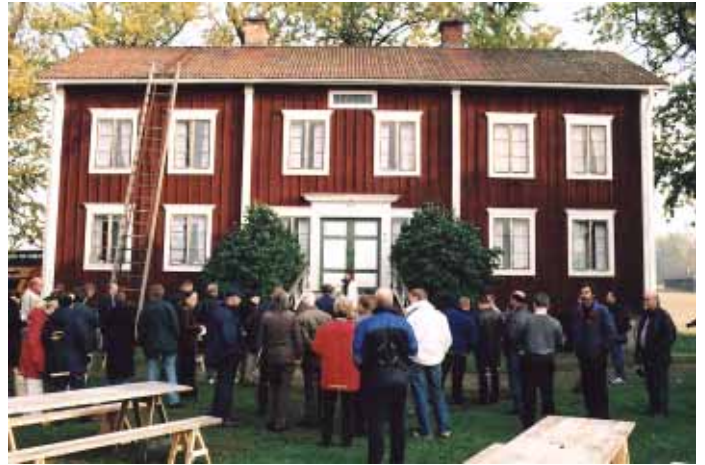
Above: The Swedish Association of Conservation Contractors (Fibor) on study tour in Halsingland, Sweden.

Below: The development of a common policy for preservation and maintenance was the main objective for a workshop in Poide on Saaremaa. Participants from Estonia, Latvia, Norway, Sweden and Finland.