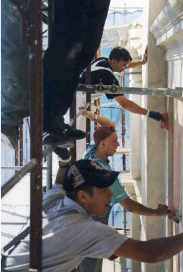
Sustainable maintenance and use of historic buildings are dependent on the survival of traditional crafts and techniques. Masons and carpenters from the Baltic Sea States participating in workshops in Sabile (above) and at Ungurmuiza (below).