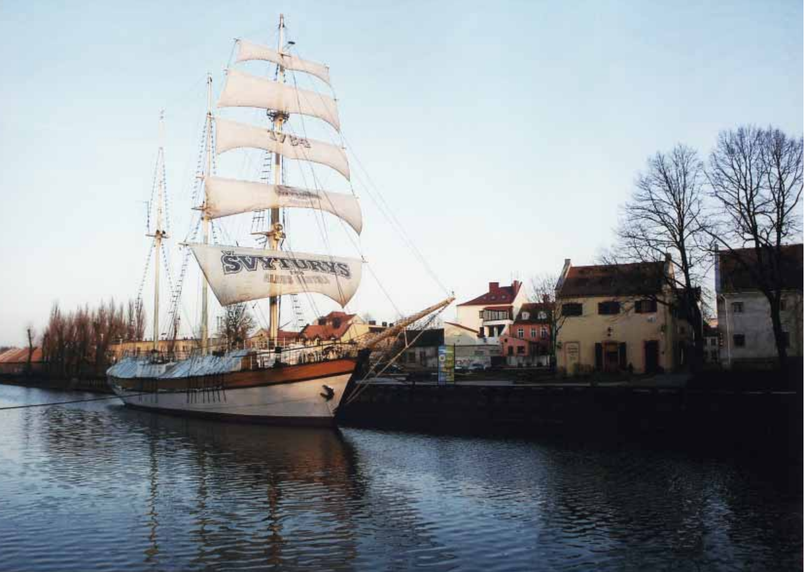
New use of an old sailing vessel; restaurant "Meridianas" in Kleipeda, Lithuania after restoration.

“Sustainable Historic Towns – Urban Heritage as an asset of Development” together with 26 partners in 9 countries.