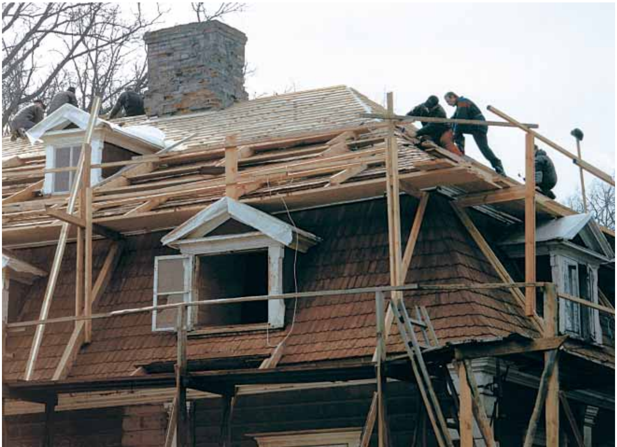
Ungurmuiza manor in Latvia renovated for future use as guest house and museum. The traditional covering of the roof is reconstructed with shingles produced in Latvia, wood tar from Estonia and red pigment from Sweden.

The use of the built heritage as a promoter of regional development has continuously been discussed in the Working Group.