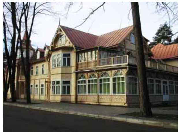
The town of Druskininkai will hopefully be the pilot town of Lithuania as a PHARE-funded part of the project. Druskininkai has well preserved wooden heritage dated from late 19 th century when the town was an important spa in the region.

and implementation of the results are trans-national. The Project Network held the first workshop at the 1 st Baltic Sea Cultural Heritage Forum in Gdansk 2003 . The Project Network will co-arrange the 2 nd Cultural Heritage Forum 2005 where it also intends to disseminate their results.