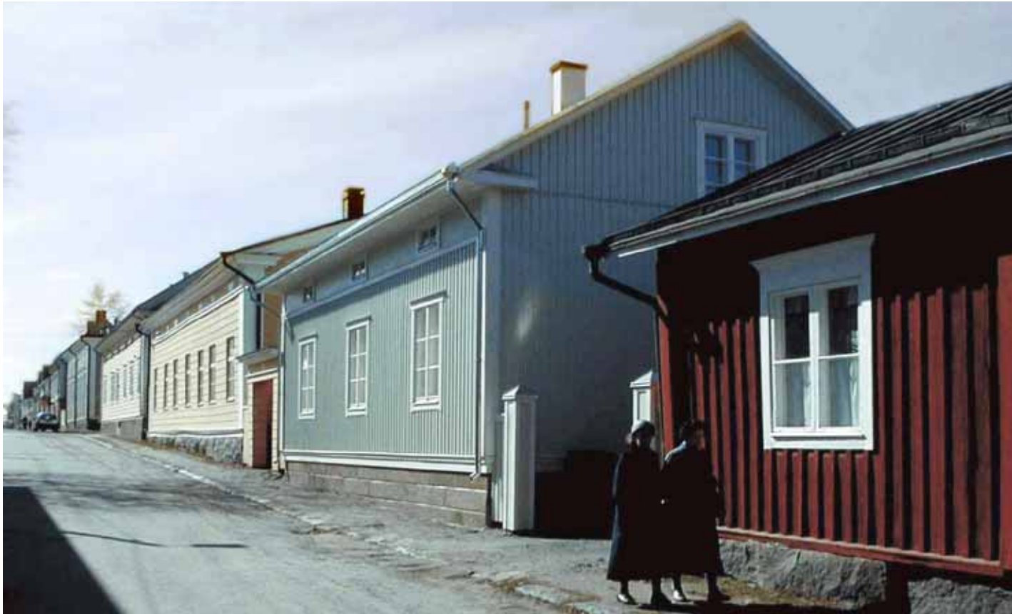
The management of urban heritage means a balance between preservation, development and change. There have to be regulations for new constructions in historic urban areas. Uusikaupunki Finland.