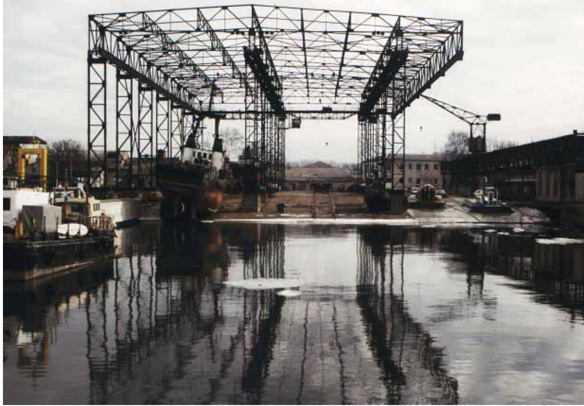
Former Lindenau shipyard in Klaipeda is important for industrial heritage history in Lithuania.