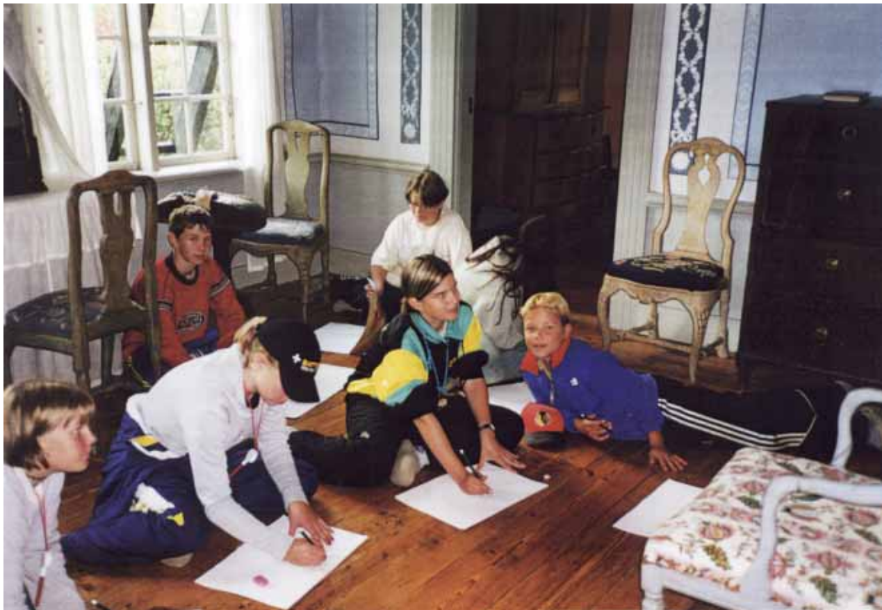
The best way to protect our common heritage is to share it with children. – School children documenting the interior of a manor house in Finland.