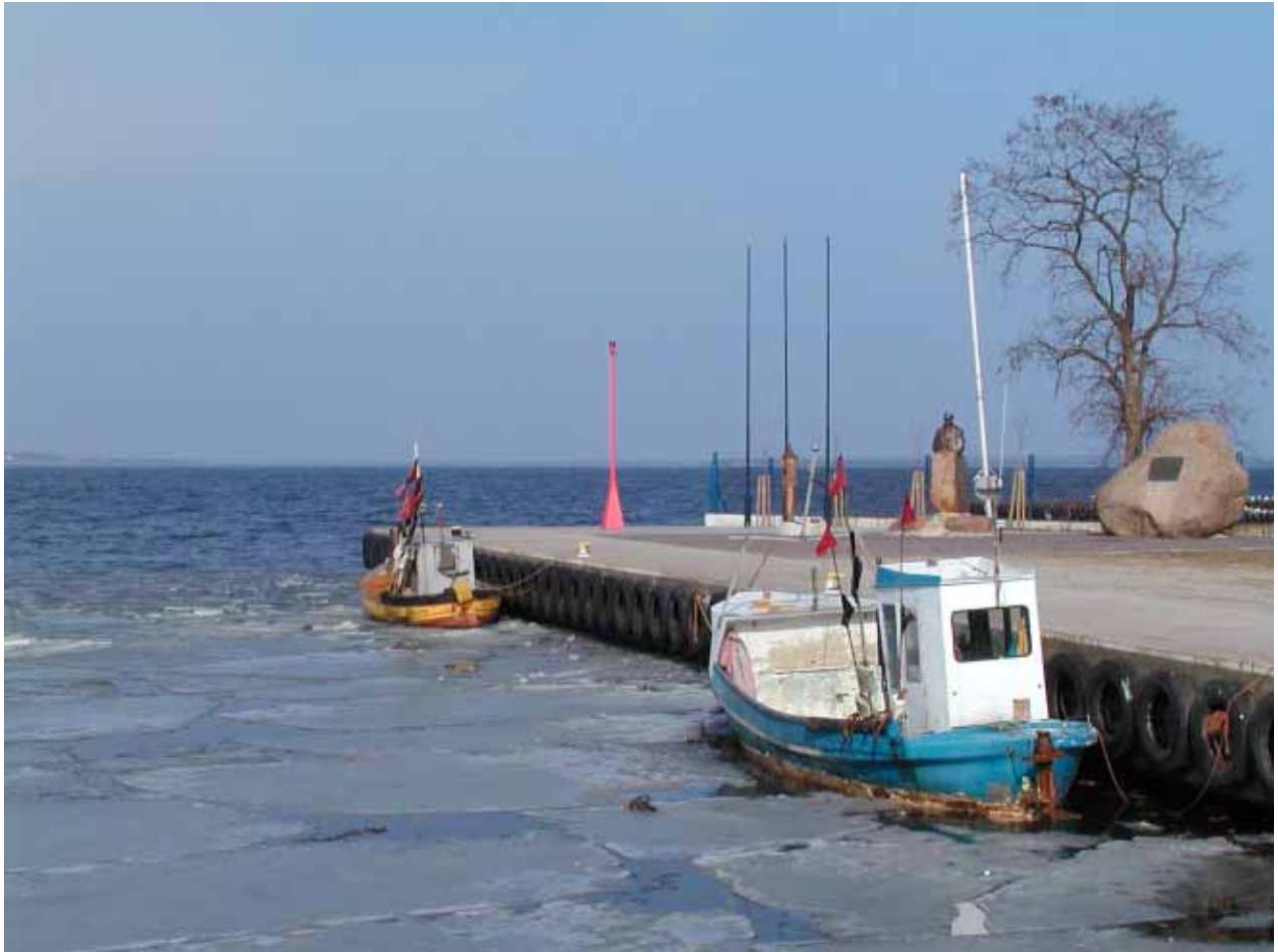
Fishing boats in the small port over the gulf in Puck, Poland. Deep inside monuments commemorating historic landmarks are visible.